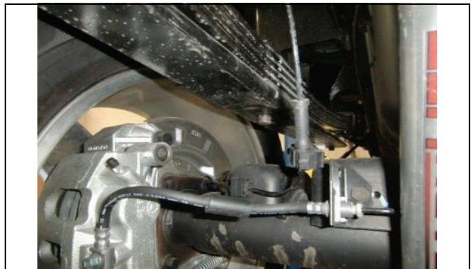
Remove U-bolts and lower axle to allow lift block positioning