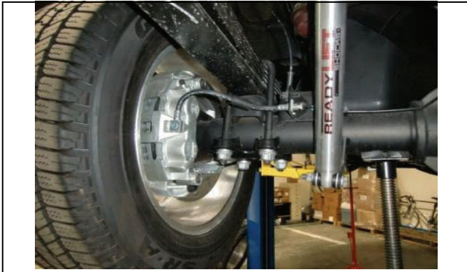
Raise and support vehicle on level ground and support frame.