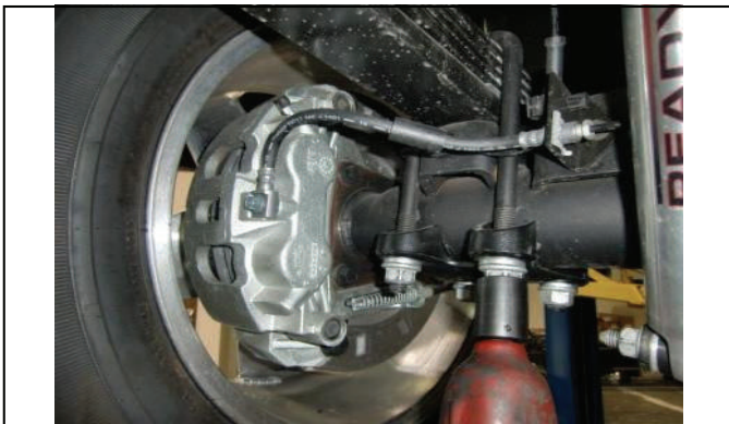
Support axle and remove U-bolt hardware and axle bracket