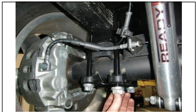
Raise axle aligning center pin and install new U-bolts/nuts.