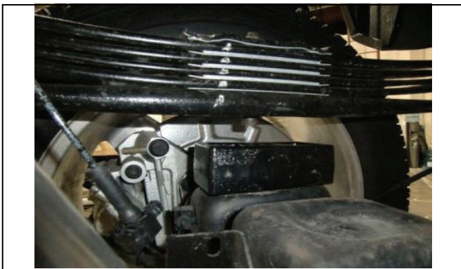
Note slight taper on block, shorter end towards front of truck