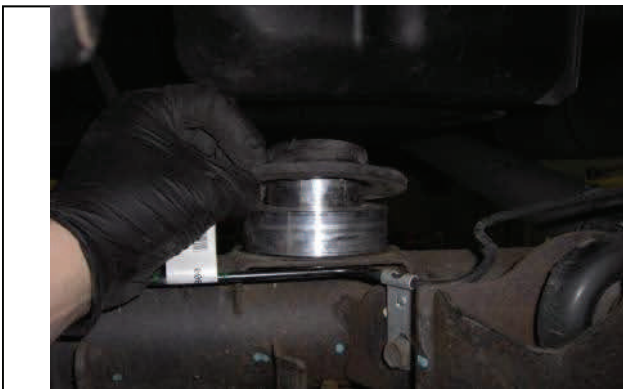
Refit OE rubber isolator on top of billet spacer