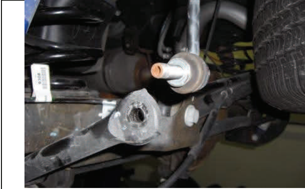
Support axle with jack and disconnect sway bar end links