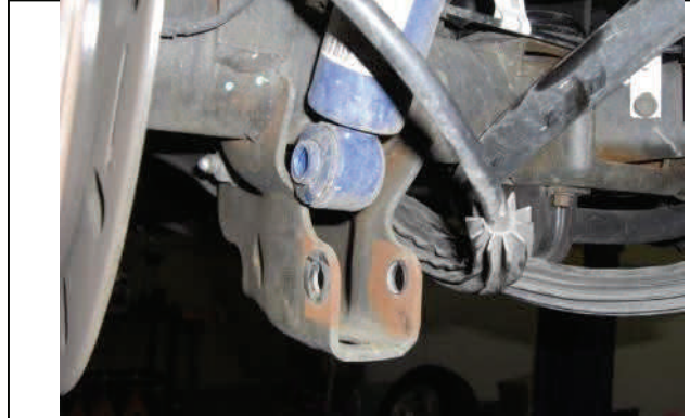
Disconnect Lower shock mounts