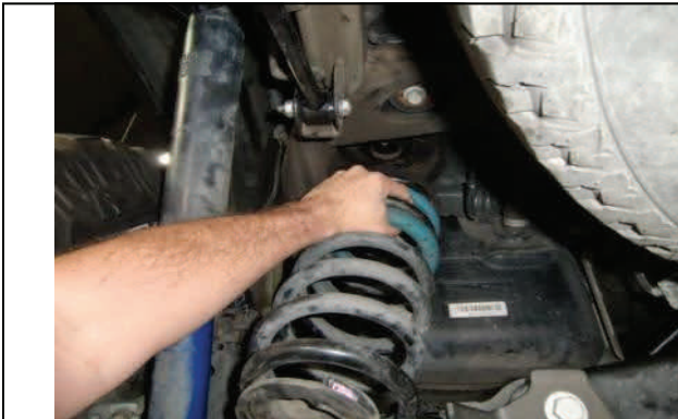
Carefully lower axle and remove coil springs and isolators