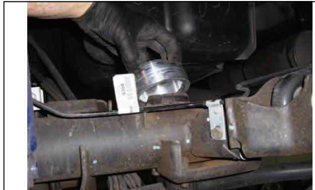
Place ReadyLIFT spacer on axle mount