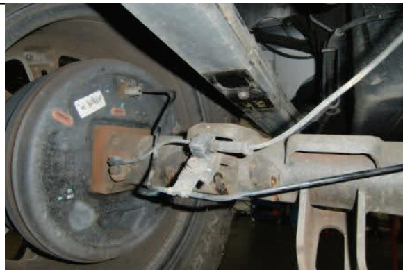
Carefully lower axle enough to install new block