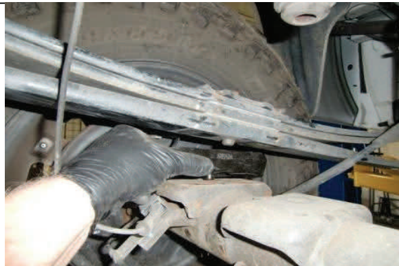
4WD models lower axle and remove factory block