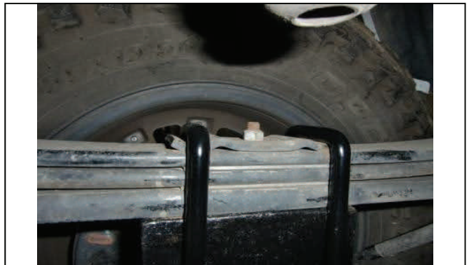
Place u-bolts over saddle on leaf pack and over axle