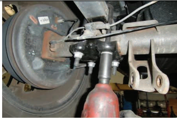
Remove u-bolt mounting hardware