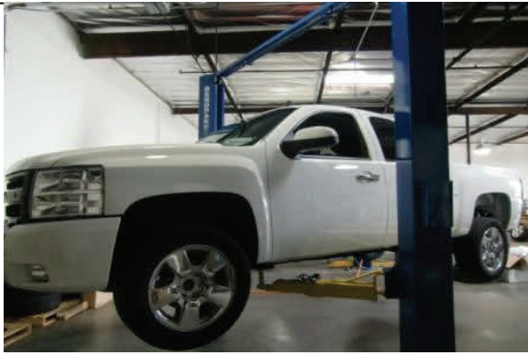
Raise and support vehicle by frame on jack stands