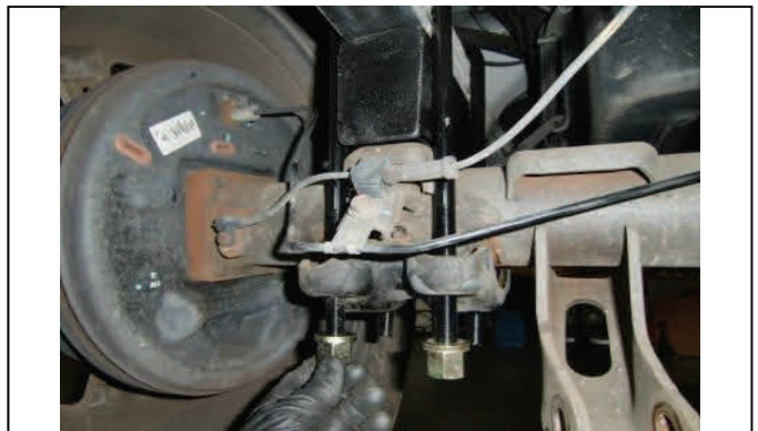
Install new hardware