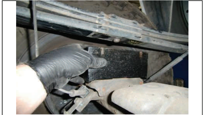
Shown (3.0" block) replacing factory block on 4WD models