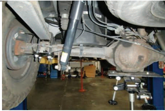
Support rear axle with jack