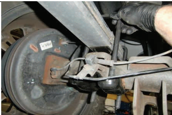
Remove u-bolts and axle mounting plate