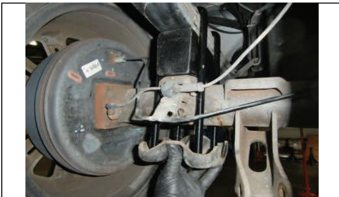
Reinstall axle mounting plate