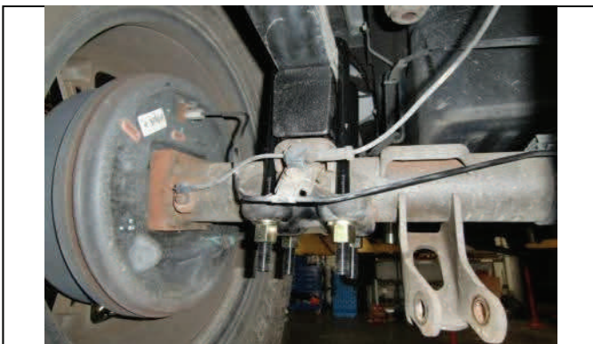
Tighten hardware and reinstall lower shock into mount

Recheck all work performed, torque hardware and lower vehicle to ground and test drive.