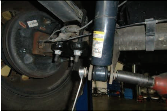
Disconnect lower shock from mount