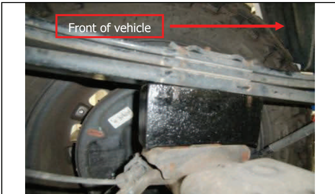
Raise axle and center locating pin on leaf pack. Note: taper