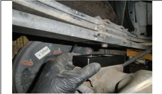
Place new block into position (1.0" block shown)