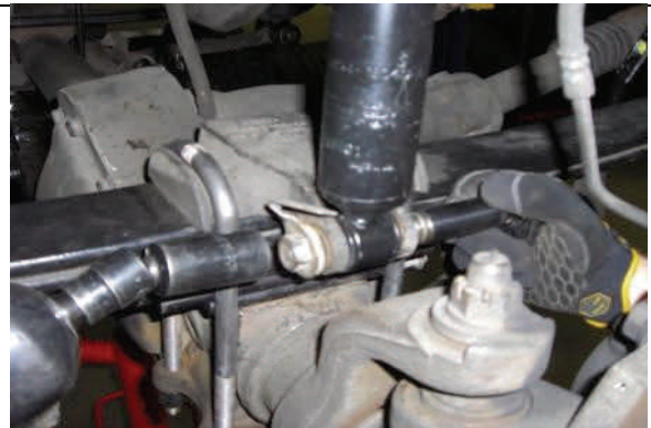
Reinstall lower shock into original position with OE hardware