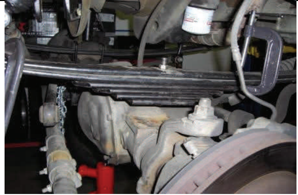
Tighten new leaf stack to OE leaves with provided nut