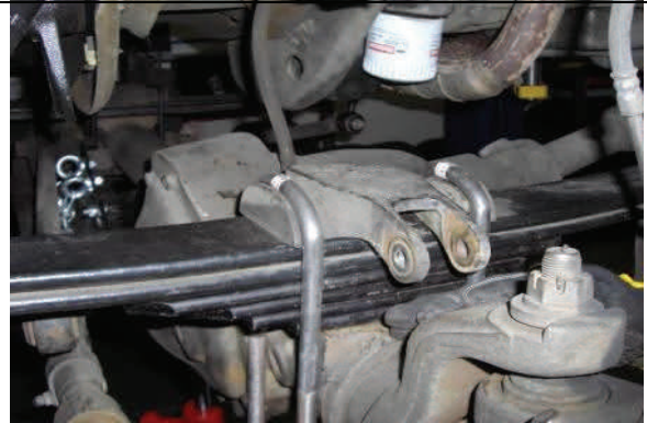
Replace spring plate with new longer U-bolts