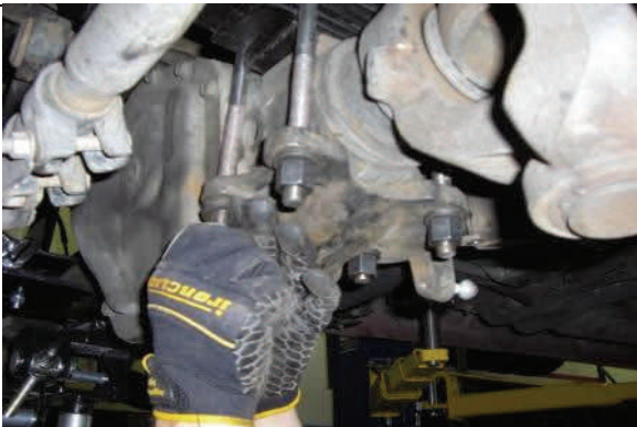
Attach lower spring plate with new hardware and tighten