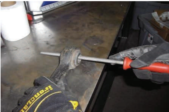
On both ends of the trac bar use a file to smooth inner sleeve