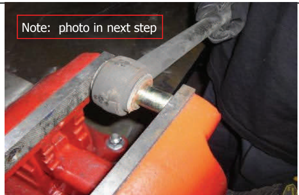
Then press new offset sleeve as shown. DO NOT HAMMER!