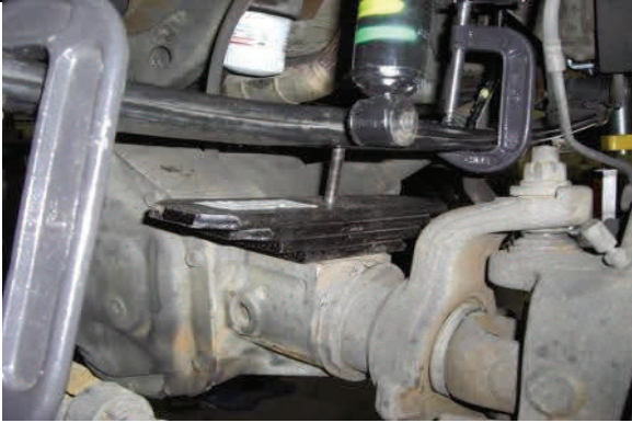
Remove nut from new center bolt and place into position