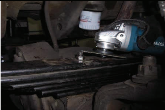
Grind excess threads to allow proper fitment of spring plate