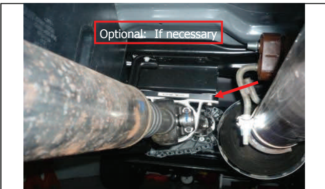
With vehicle on the ground install carrier bearing drop plate.

Note: Final torque of the new U-bolts should be done with the vehicle on the ground and to the proper specs. Make sure the u-bolts have the equal amount of threads visible on all (8). Take care to tighten the carrier drop plate centered and aligned on the cross-member. Recheck all work before and after test drive.