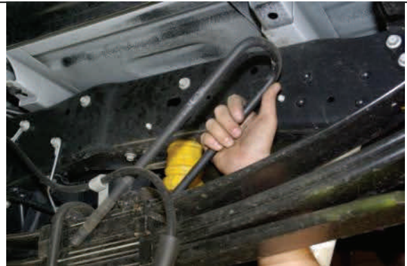
Remove U-bolts and slowly lower axle to remove OE block.