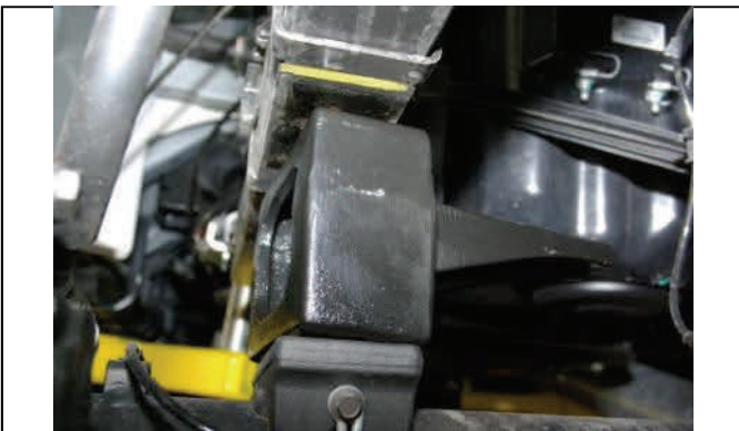
Lower axle enough to install taller block, align and raise axle