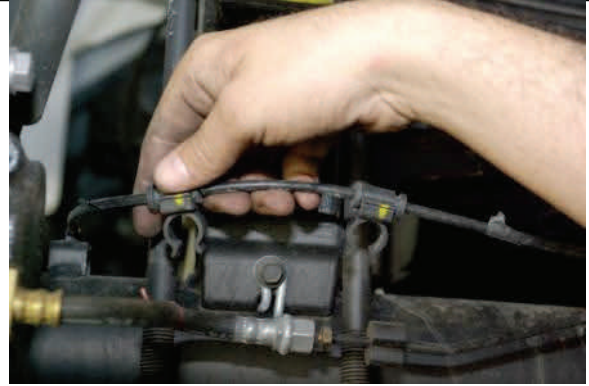
Vehicles with ABS/TC remove clips from U-bolts.