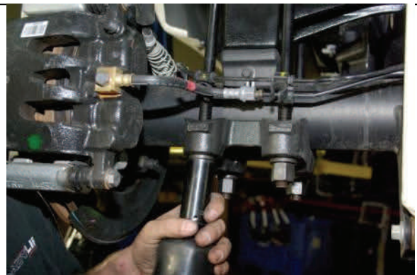
Install longer U-bolts and nuts onto axle plate. Torque later.