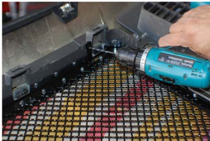
8. Lay new grille into opening, press firmly against shell, mark and drill 1/8in. holes for each of the six brackets.