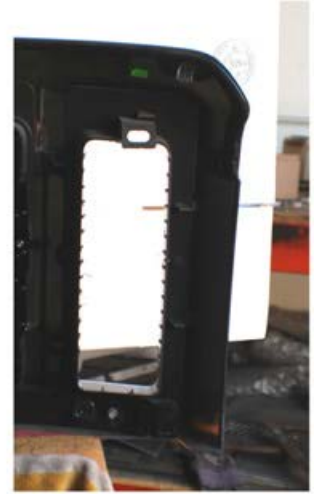
7. Cut side opening out