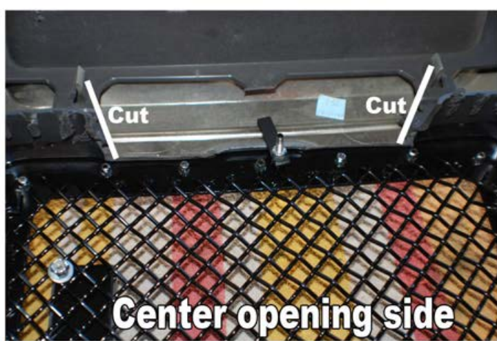
6. Cut plastic backing out on center opening down and around to look like this.