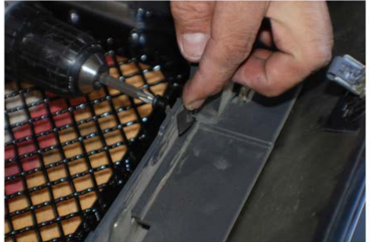
9. After holes are all drilled, take the #10 screws and screw through hole while attaching spring nut to back side.