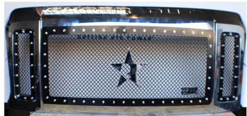
11. Finished grille, Now reverse steps 1 - 5 to re install grille shell.