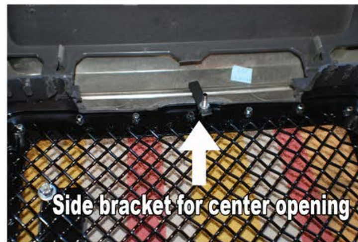
10. Attach side bracket for center opening as shown.