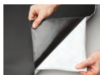
Peel 'n stick.