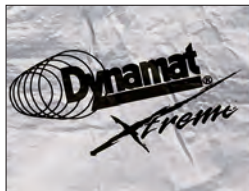
10" x 10" sheet

Eliminates or reduces noise generated by road, engine, drive train, suspension system and panel vibration.