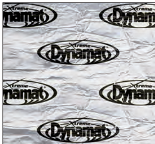
18" x 32" sheet