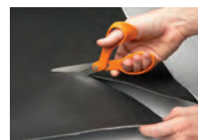
Easy to cut to size.