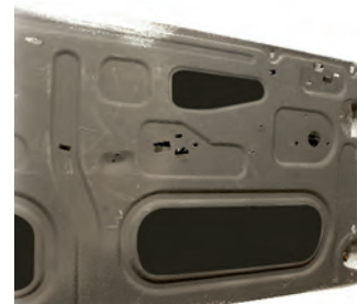
12" x 12" Pad