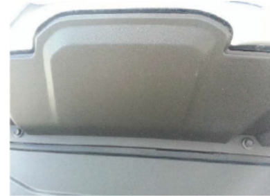
2015-2020 4X2 WITHOUT TOW HOOK