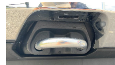
2021+ NO CUTTING REQUIRED. REMOVE TOW HOOK BOOT OR COVER PLATE

Learn more about grille guards and bull bars we have.