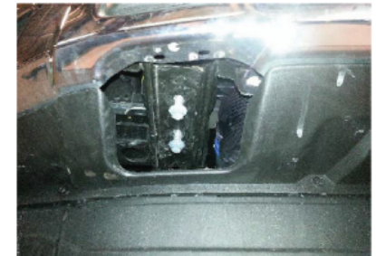
2015-2020 4X4 WITH TOW HOOK