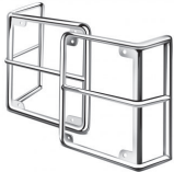
(2) Tail Light Guards

NOTE: Actual product may vary from illustration.