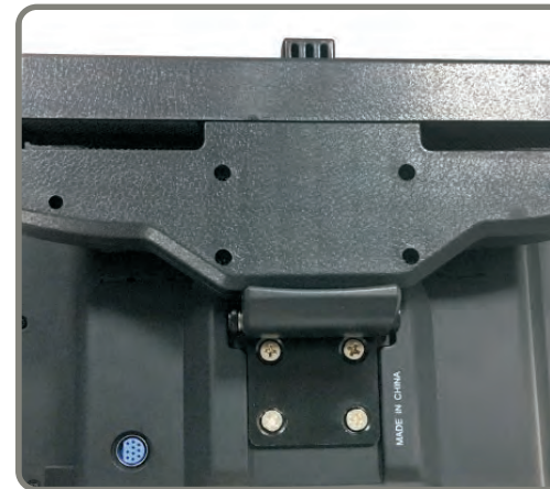
Mini Din Connector