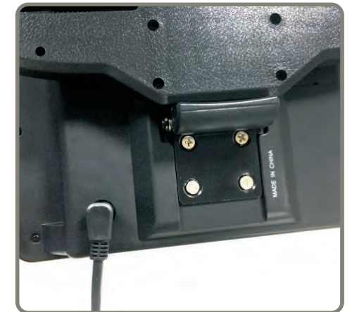
Attach power cable to connect