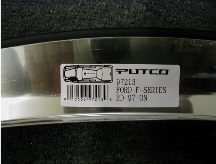
Fig. 1 (Black arrow points to trim placement)

NOTE: THE PICTURES IN THIS INSTRUCTION ARE FOR ILLUSTRATION PURPOSES ONLY.