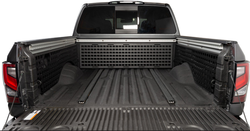
Assembled Titan MOLLE Set

Once the side plate is installed in the vehicle, ensure all fasteners are tightened until snug, but do not overtighten.