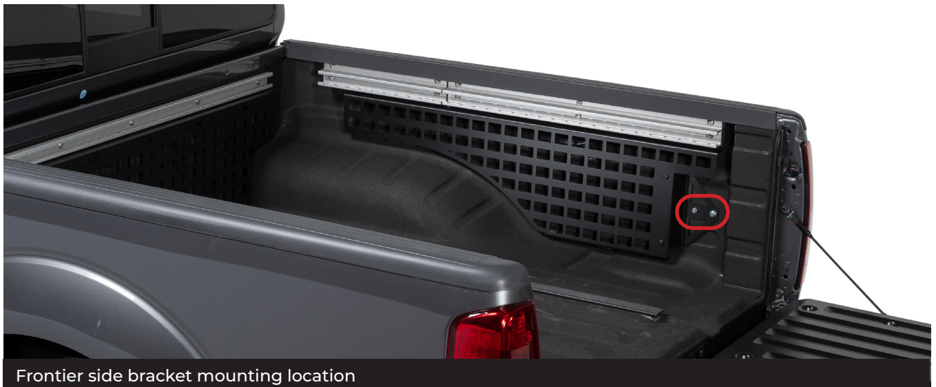
Frontier side bracket mounting location

Note: Some Nissan Frontiers do not include tie-down hooks, leaving the mounting holes blank. In this case, use a pliers or a trim-removal tool to pull out the plastic plugs where the tie-down hooks would be, then attach the side brackets using the supplied M8 bolts and a T40 Torx driver.