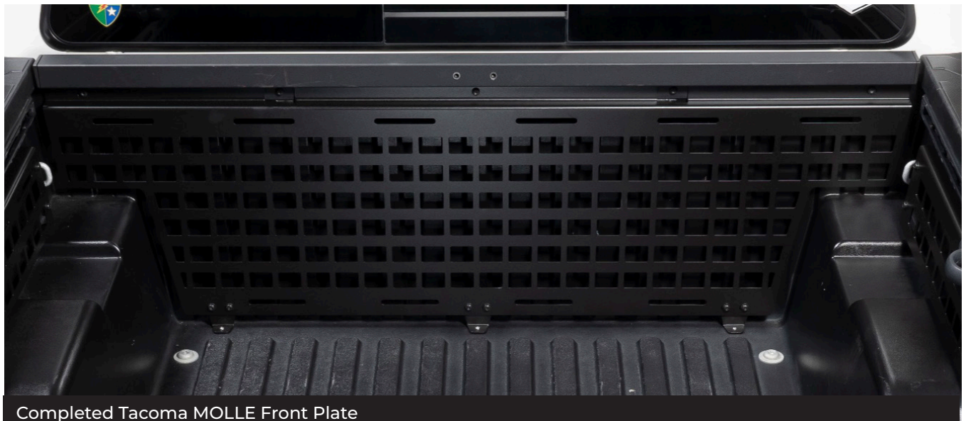
Completed Tacoma MOLLE Front Plate

Your new MOLLE Panel is now successfully installed on your vehicle!