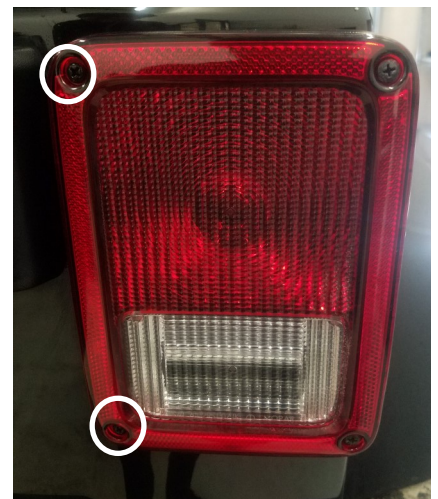
Figure 1: Remove 2 screws.