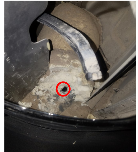
Figure 2: Foam removed and hole exposed.