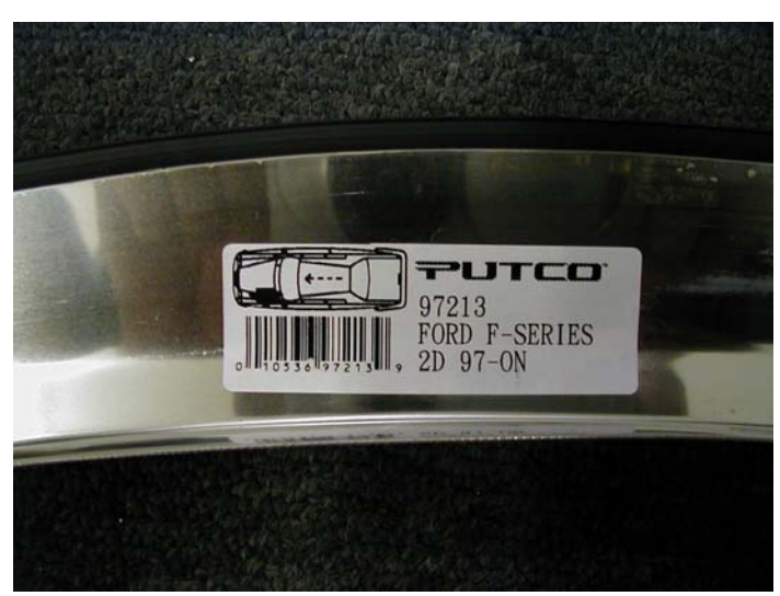
Fig. 1 (Black arrow points to trim placement)