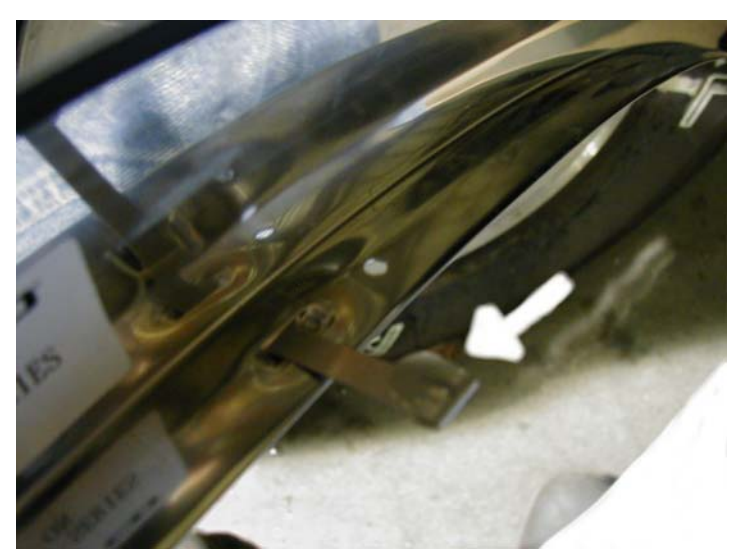
Arrow points to bent end (band should bent up)