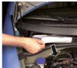
Pic. 2 - Cabin filter located behind in the engine bay, under the windshield