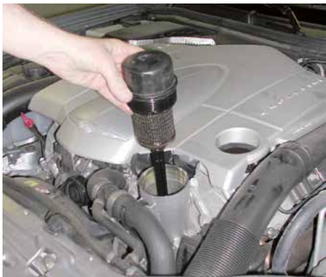
Pic. 4a - 4b