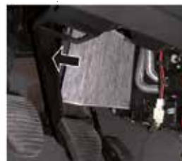
Pic. 3 - Cabin filter located near the pedals