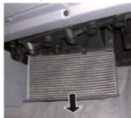
Pic. 1 - Cabin filter located behind the glove box