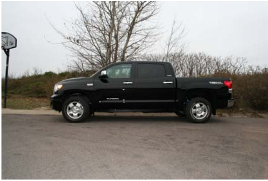
Vehicle BEFORE Installation