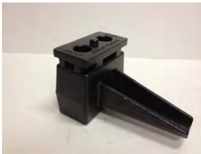
1.0" REAR LIFT OPTION

Step 9: Determine whether you want a 1.0", 1.5" or 2.0" rear lift, and orient the components according to the images shown below to achieve your desired ride height.