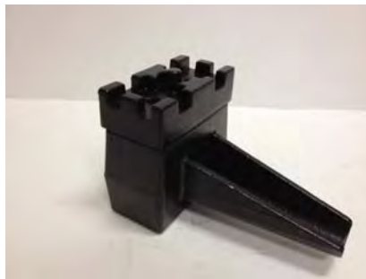
1.5" REAR LIFT OPTION