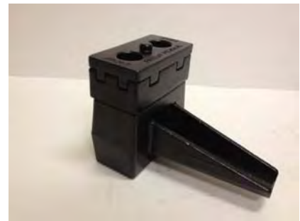
2.0" REAR LIFT OPTION

IMPORTANT! THIS IS A PATENTED, MECHANICALLY-SECURED & INTERLOCKING SYSTEM DESIGNED ONLY TO BE USED ALONE OR WITH THE ORIGINAL OE LEAF SPRING BLOCKS REMOVED FROM THIS VEHICLE.