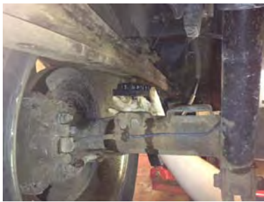
1.0" REAR LIFT OPTION

Step 5: Determine whether you want a 1.0", 1.5" or 2.0" rear lift, and orient the components according to the images shown below to achieve your desired right height. If installing in the 2.0" configuration, be sure that the indicia stamped FRONT on BOTH interlocking blocks is positioned toward the FRONT of the leaf spring. (Figure C, below)