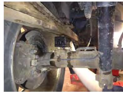
2.0" REAR LIFT OPTION