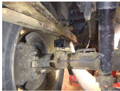
1.5" REAR LIFT OPTION