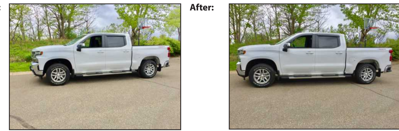
Shown with front level kit 75-1060G set at 2.5"

<u>IMPORTANT!</u> Check all fasteners for proper torque. Check to insure there is adequate clearance between all rotating, mobile, fixed and heated members. Check steering for interference and proper working order. Test brake system.