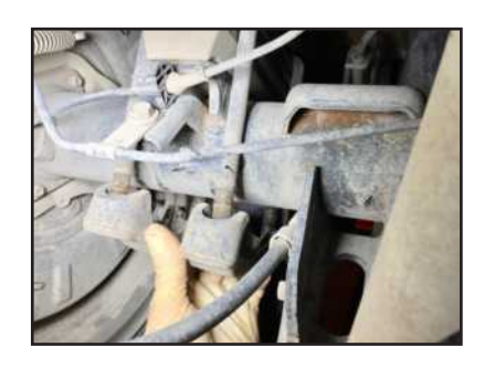
STEP 5: Remove the four U-bolt nuts and washers on each side of the vehicle, and remove lower U-bolt axle brackets.

STEP 6: Install desired amount of lift. Make sure alignment pins line up with spring and axle. Utilize lower portion of block to get 1.0" rear lift as shown here.