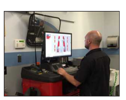
STEP 13: Perform a complete wheel alignment, utilizing a Certified Alignment Technician with experience working on lifted vehicles.

STEP 14: ADJUST HEADLIGHT AIM to accommodate new ride height position.