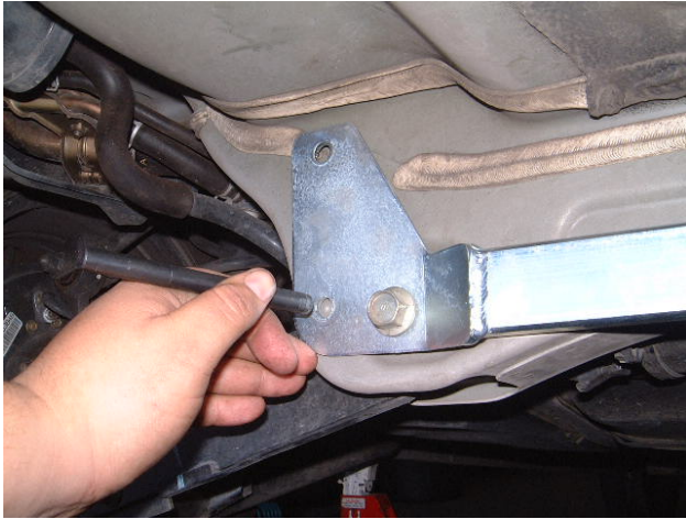
Figure 2 Driver side view from rear