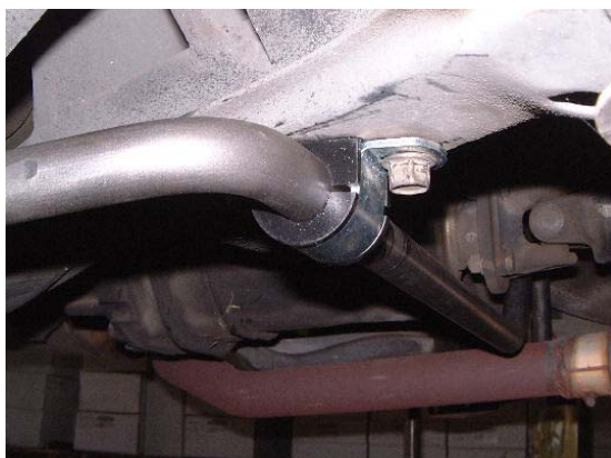
View of the new bushing bracket