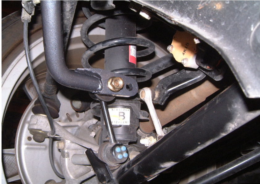
Rear bar shown in the stiff position.