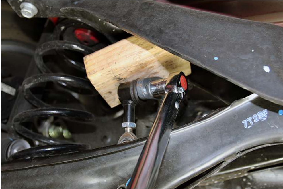
Figure L (Torque the left hand upper link nut)