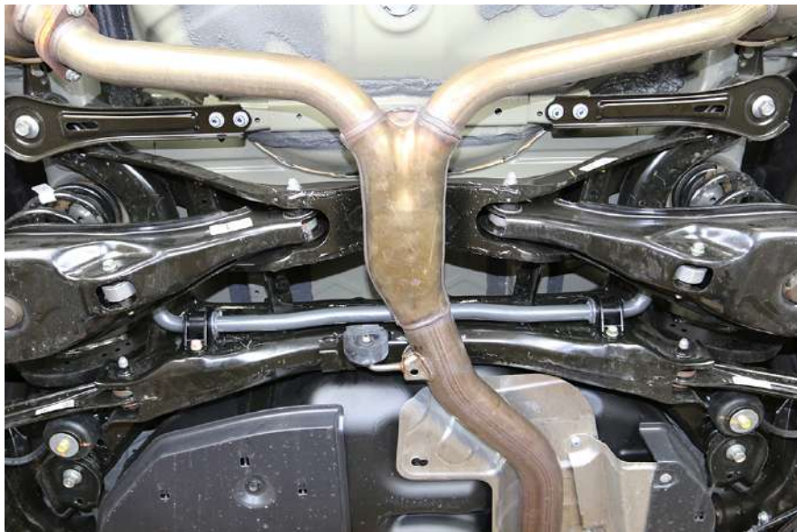
Your installation is now completed, Accord shown.