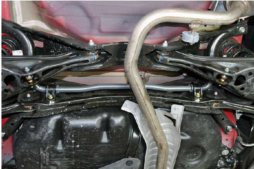
Your installation is now completed, Civic Sport shown.