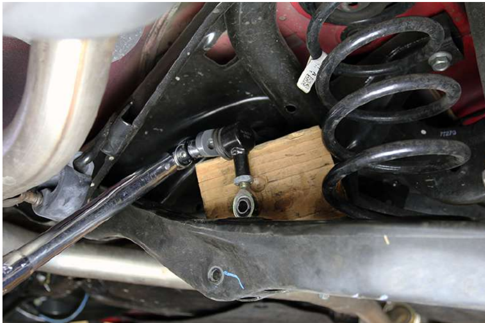
Figure M (Torque the right hand upper link nut)