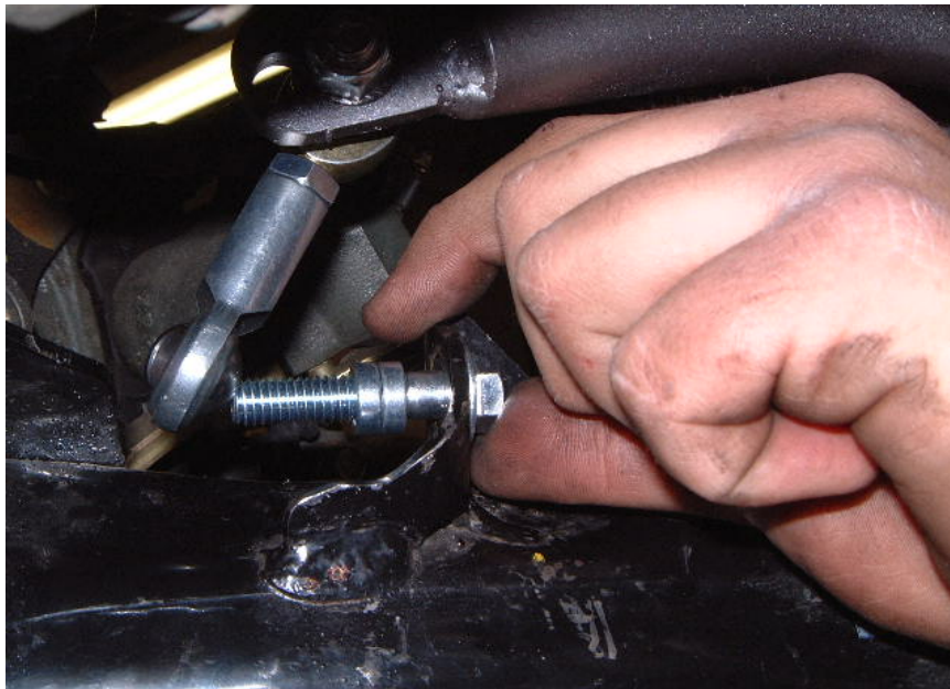
Figure 7 Passenger side using two spacers next to the heim and one on the opposite side.