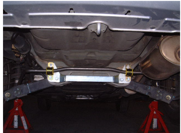
Figure 3 Rear of vehicle