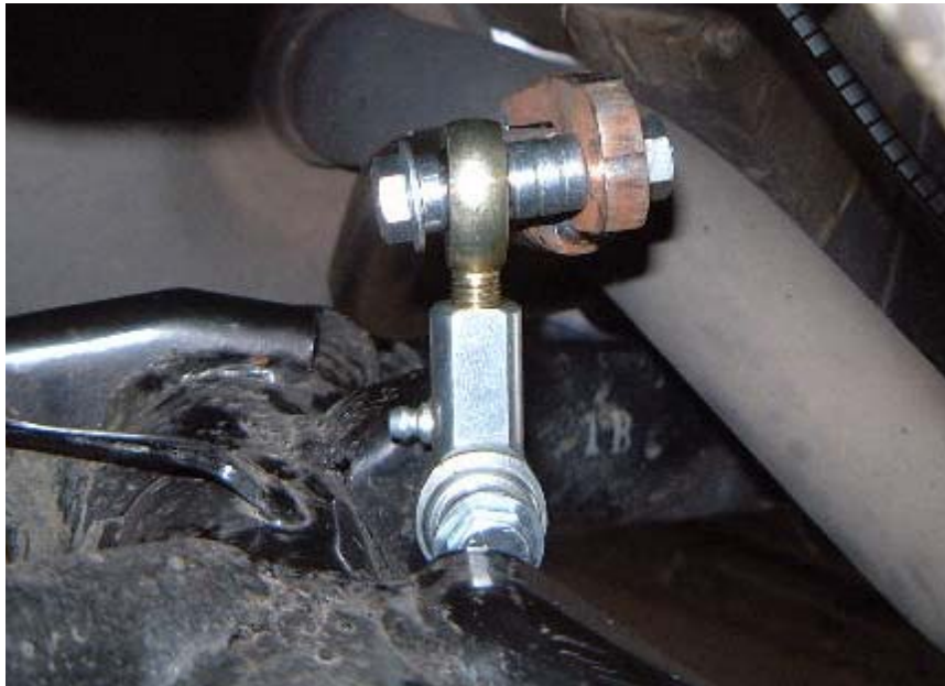
Figure 6 Passenger side shown from the front. Three spacers on the tab side and one on the opposite side of the heim.