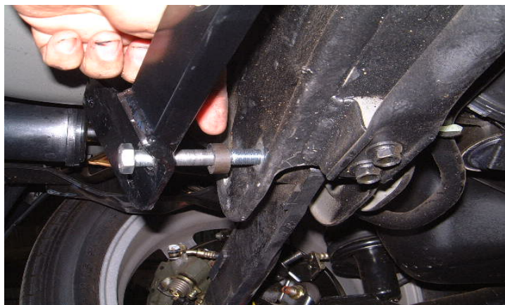
Figure 1 Driver side as viewed from underneath