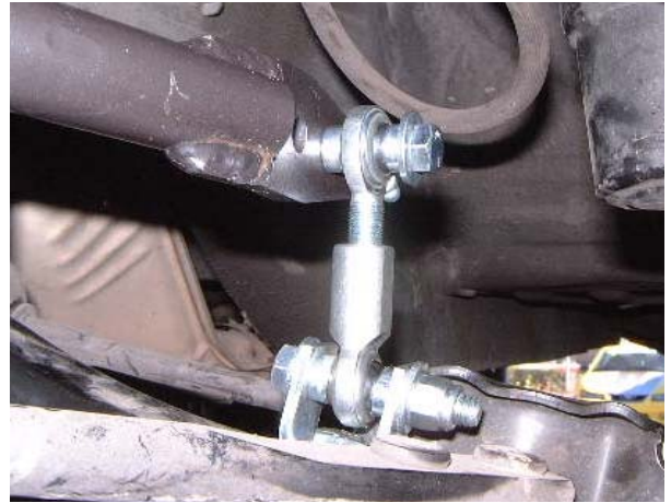
Driver side shown from the front