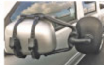
30-0086 XLR 2.5