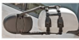
30-0083 XLR Dual Head