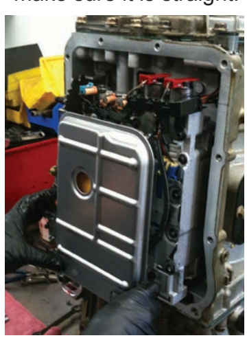
Special Note: If installing upside down you might need to hold it in place.

Insert the new filter and make sure it is straight.