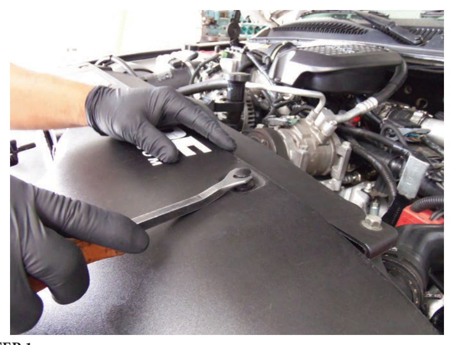
STEP 1 Remove retaining clips and radiator cover.