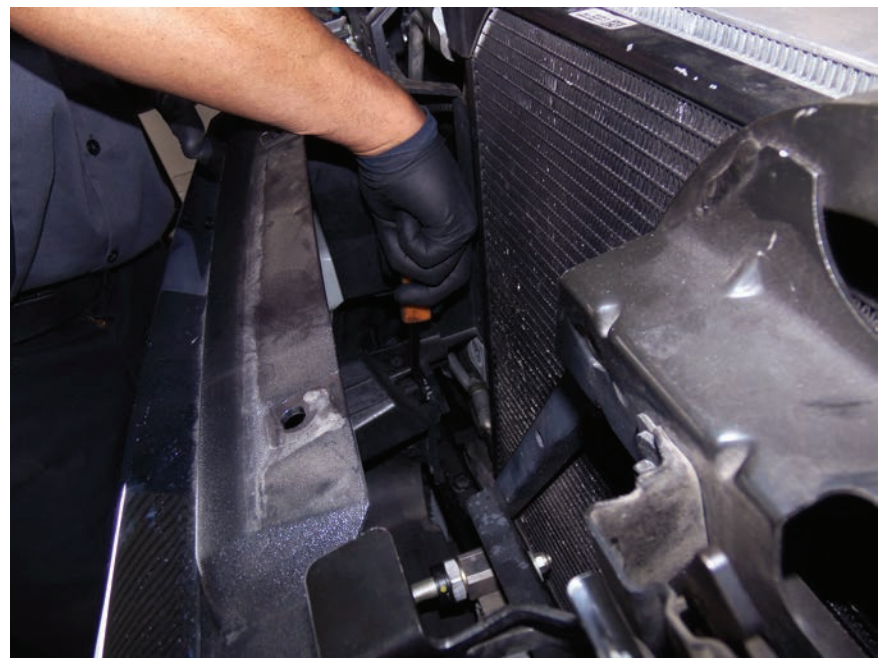
STEP 4 Pull grill clips.