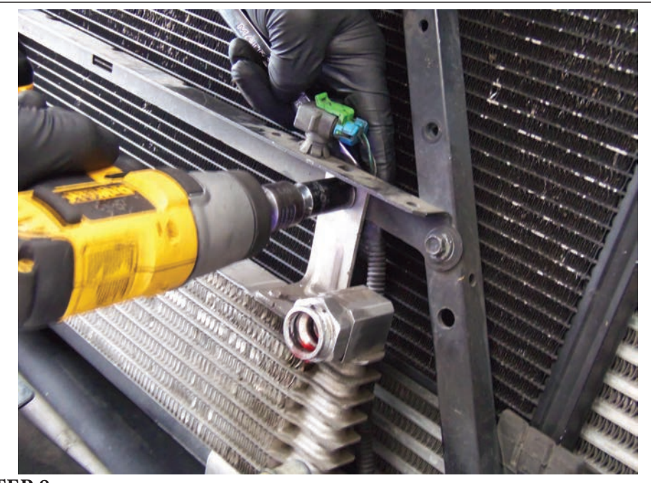
STEP 8 Remove bracket bolts and cooler.