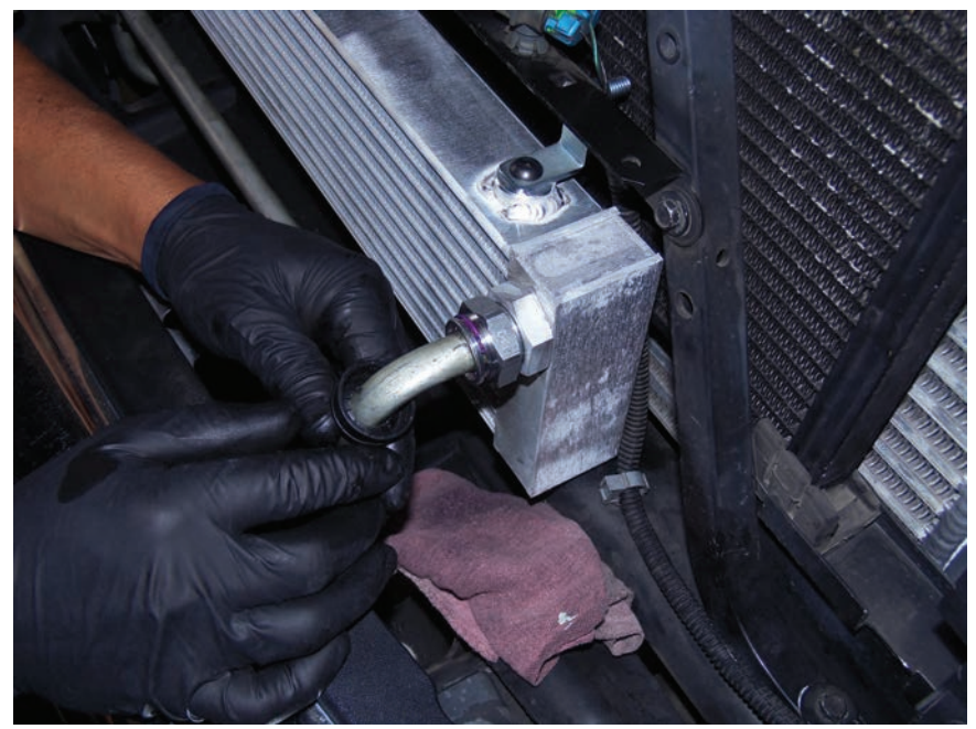
STEP 12 Slide the clip holder into position.