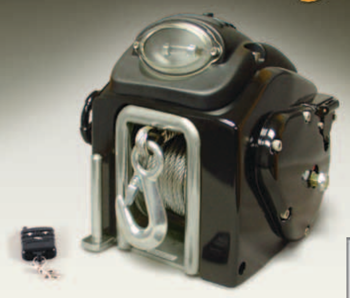
Both the RC 30 & RC 23 include: