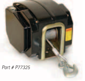
➤ Vertical lift capacity of 1650 lbs (Not to be used as a hoist)