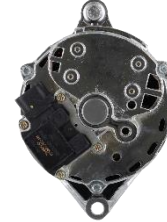
OEM Ford 2G Int Regulator 1987-93