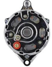
OEM Ford 1G External Regulator 1965-86