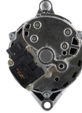
OEM Ford 2G Int Regulator 1987-93