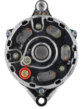
OEM Ford 1G External Regulator 1965-86