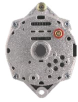
GM 10SI Internally Regulated