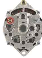
GM 10DN Externally Regulated