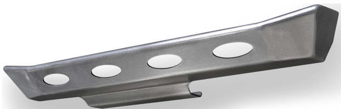
17-63-030 JK Brawler MID Front Skid Plate

These installation instructions apply to the following Poison Spyder products: