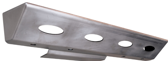
17-59-030 JK Brawler Lite Front Skid Plate

These installation instructions apply to the following Poison Spyder products: