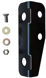
'12+ INSTALL KIT