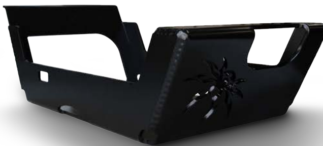
JK EVAP SKID