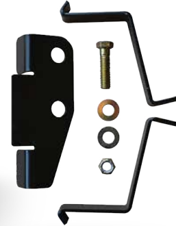
'07-'11 INSTALL KIT

Thank you for purchasing a Poison Spyder JK Evap Skid. The Skid will protect your Jeep's vulnerable evaporative canister from damage on the trail. Note that the installation procedure, brackets and hardware are different for '07-'11 and '12+ JK's (hardware and instructions for both are included). Installation is fairly simple with the right tools and good mechanical abilities. If you are not confident in your mechanical skills, please seek the help of a professional to perform the installation. Please read through these entire instructions before proceeding with installation.