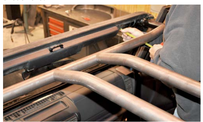
While holding everything in place correctly located, tack the A-Crossbar and Forward Stringers into place.

Use the Forward Stringers to locate the A-Crossbar the proper distance forward from the main hoop of the factory roll cage. Use a measuring tape to confirm that the A-Crossbar is the same distance from the windshield at each end.