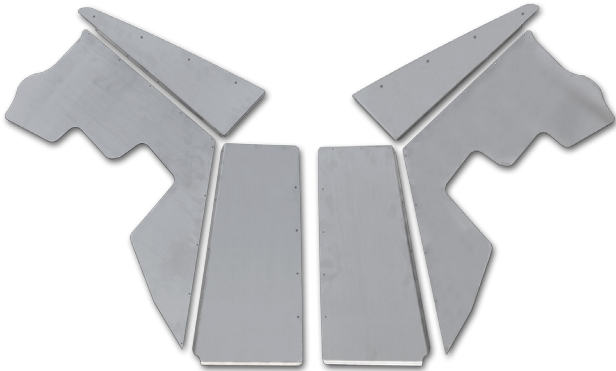
14-02-099 - TJ DeFender™ XC Solid Inner Fender Kit