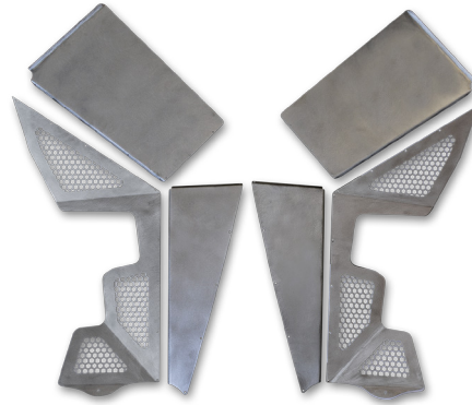
14-02-080-V - TJ DeFender™ Vented Inner Fender Kit

Thank you for purchasing Poison Spyder DeFender™ Inner Fenders for your Jeep. Installation is fairly simple. However, some subsequent procedures such as re-mounting under-hood components are outside the purview of these instructions. If you are not confident in your mechanical skills or that you will be able to figure out and execute solutions to these problems on your own, please seek the help of a professional to perform the installation. Please read through these entire instructions before proceeding with installation.