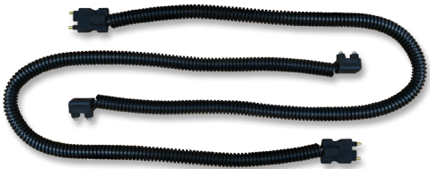
41-06-020 • 24in LED Back-Up Light Extension Harness (Pair)