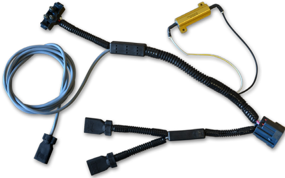
41-06-010-P • JK LED Taillight Harness - Passenger Side