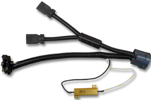
41-06-010-D • JK LED Taillight Harness - Driver Side