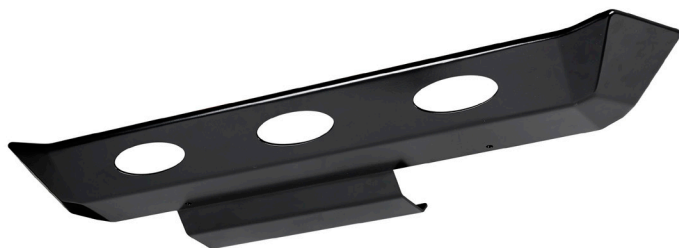
19-57-030P1 JL Bruiser Front Skid

These installation instructions apply to the following Poison Spyder products: