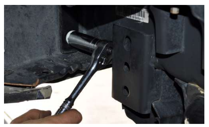
With these nuts removed, remove the bumper from the Jeep.