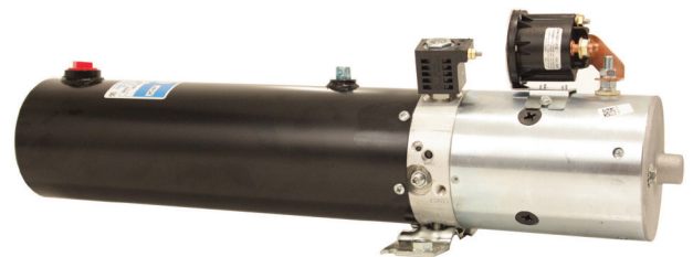
❺ HYDRAULIC PUMP

Discover other bed accessories on our website.