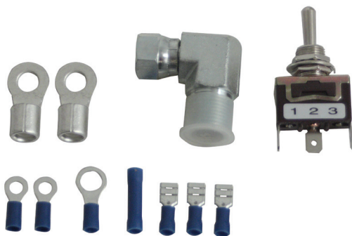
❷ ELECTRICAL KIT