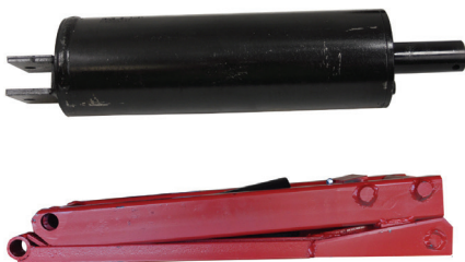
❹ SCISSOR ASSEMBLY WITH CYLINDER