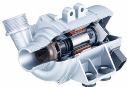
Fig. 2: Section view of the electric coolant pump (CWA 200)

Eliminating the mechanical commutation system leaves the durability of the rotor bearings as practically the only limiting factor for service life. In addition to that, the lower number of moving parts results in significantly reduced noise.