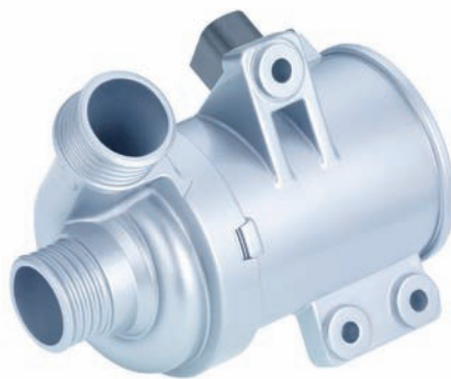
Fig. 5: CWA 400

The use of an electrically-driven coolant pump for drive designs of the future, such as those using hybrid or fuel cell technology, is inevitable. At these concepts a mechanical drive via crank shaft and belt is only conditionally or not at all available.