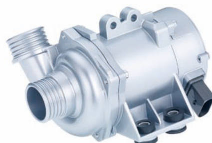
Fig. 3: CWA 200