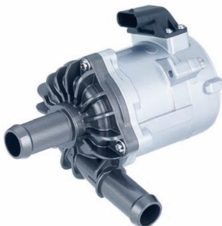
Fig. 1: CWA 50

Besides areas of application, the pumps are also classified according to output: the electric water circulation pumps with a total output of 15 to 30 W and the electric coolant pumps with 50 W to 400 W output.