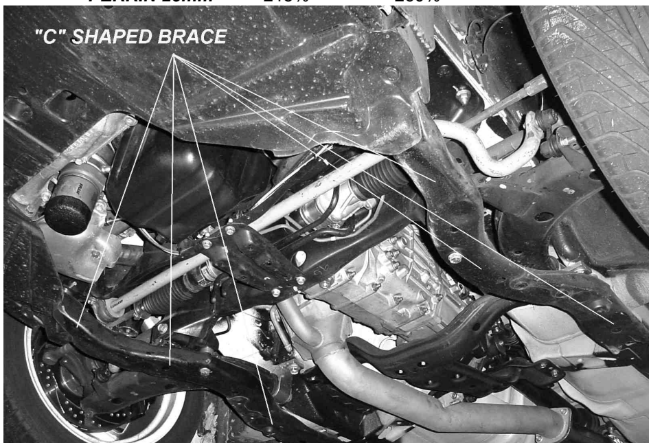
Above picture shows sub frame bolt locations. STI models may contain 1 extra bolt.