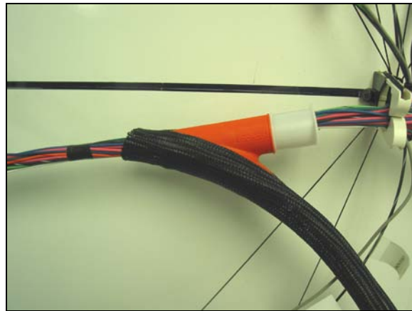
The “spreader” of the tool is then inserted into the PowerBraid. With the tool inserted, pull the tool down the length of the PowerBraid. This will insert the harness into the braid as it is pulled.