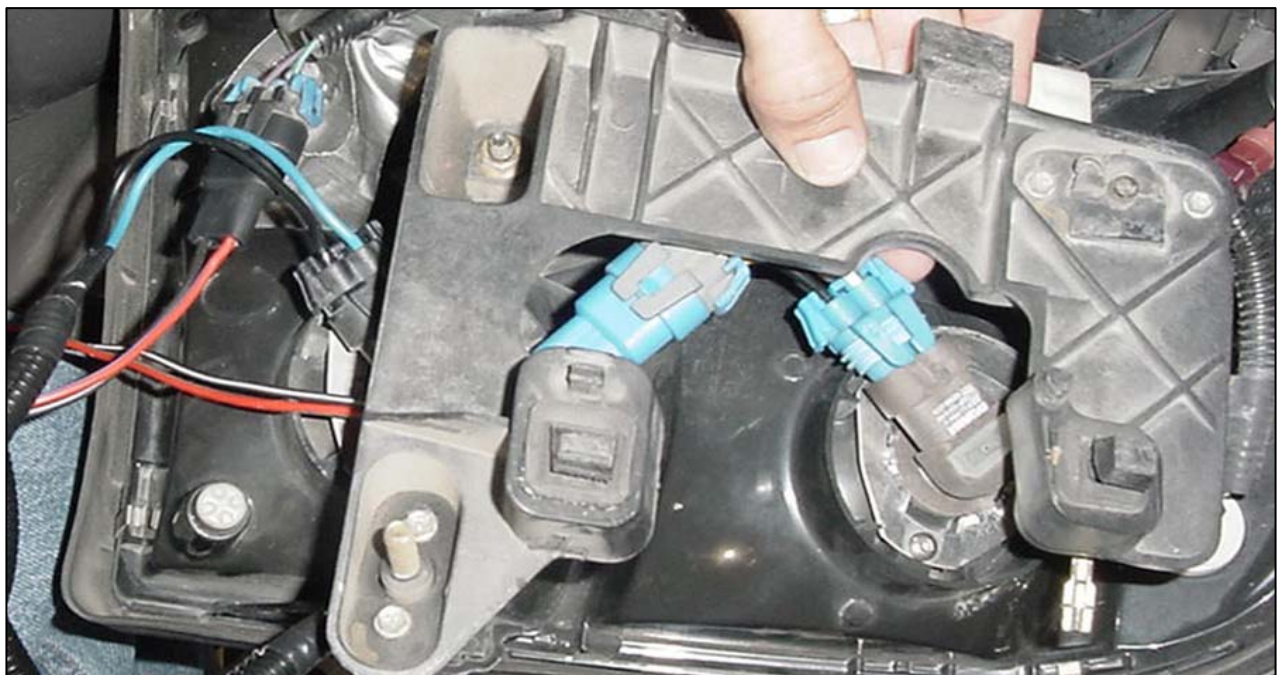
Illustration 3 Painless Headlight Relay Harness plugged into headlights