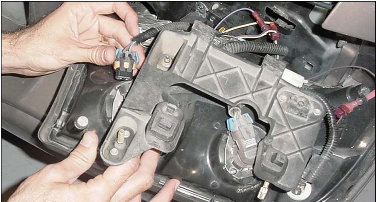
Illustration 1 Disconnection of Headlight Bulb Connectors