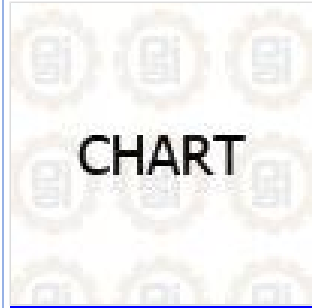
Drive Train 2016 Gear Ratio Application Chart - CRD 150, CRD 151