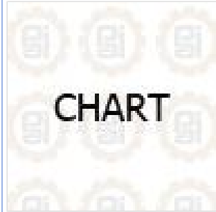
Drive Train 2016 Gear Ratio Application Chart - CRD 150, CRD 151