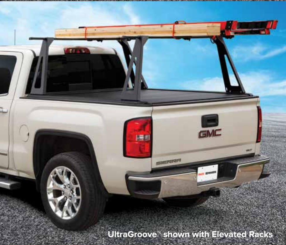
UltraGroove™ shown with Elevated Racks